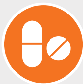
Nonsteroidal anti-inflammatory drugs (NSAIDs)

There is no cure for migraine. Migraine is complex, and while there are various treatments available, there is a significant need for new treatment approaches. Acute medications fall into general classes of medicine: