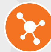
Triptans Serotonin agonists

Still, more than one-half of Americans who suffer from migraine try to manage their illness with nonprescription medications, and have typically cycled through multiple nonprescription medications by the time they seek treatment. 4